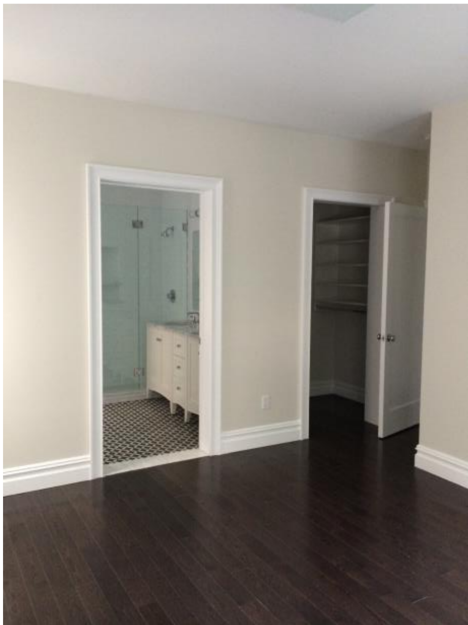
8 View in bedroom leading to bathroom and walk-in closet