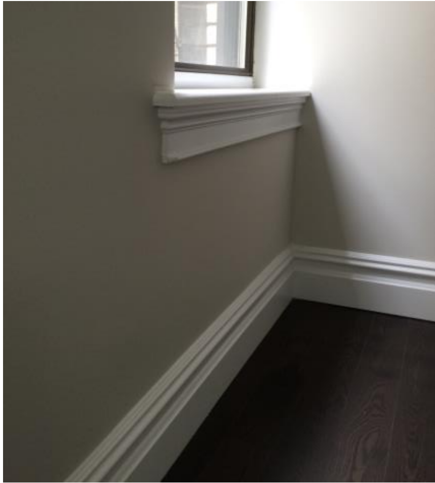
7 Extra attention paid to fine detail in the trim work