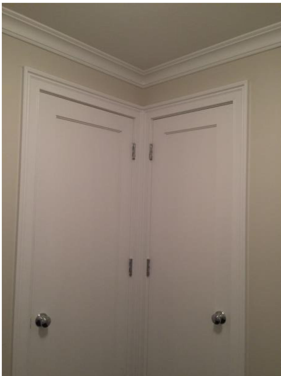
2 One of many closet/storage spaces located in hallway