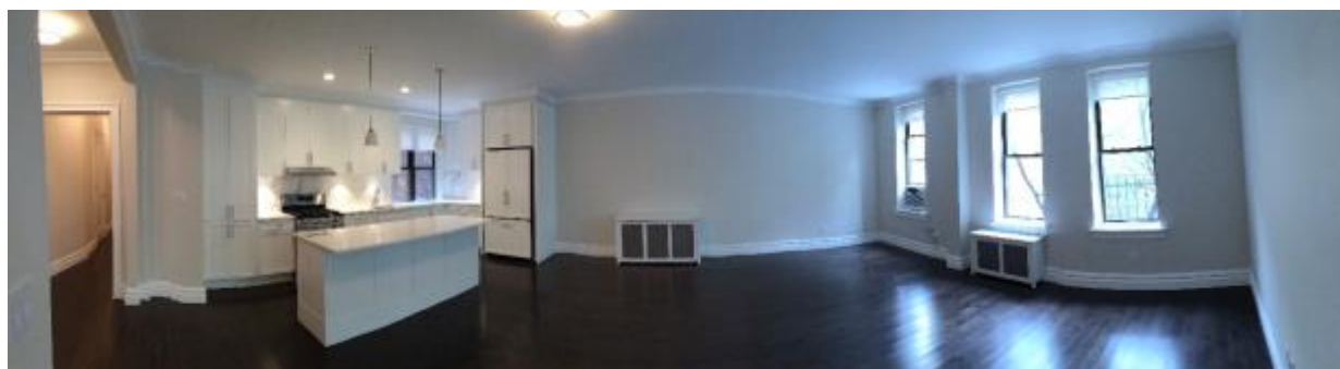
3 Panorama view of Kitchen and Living Room