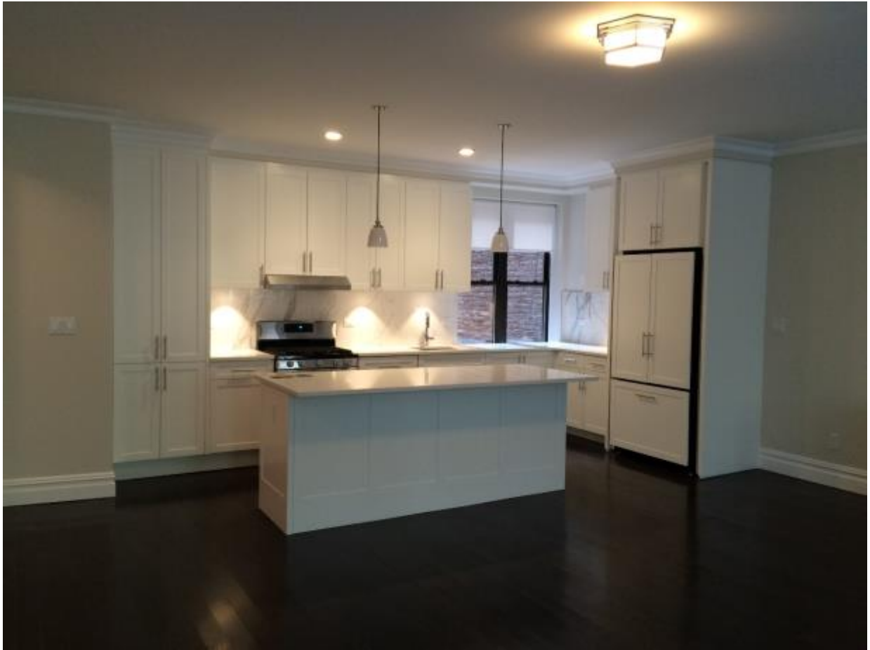
4 Finished Kitchen