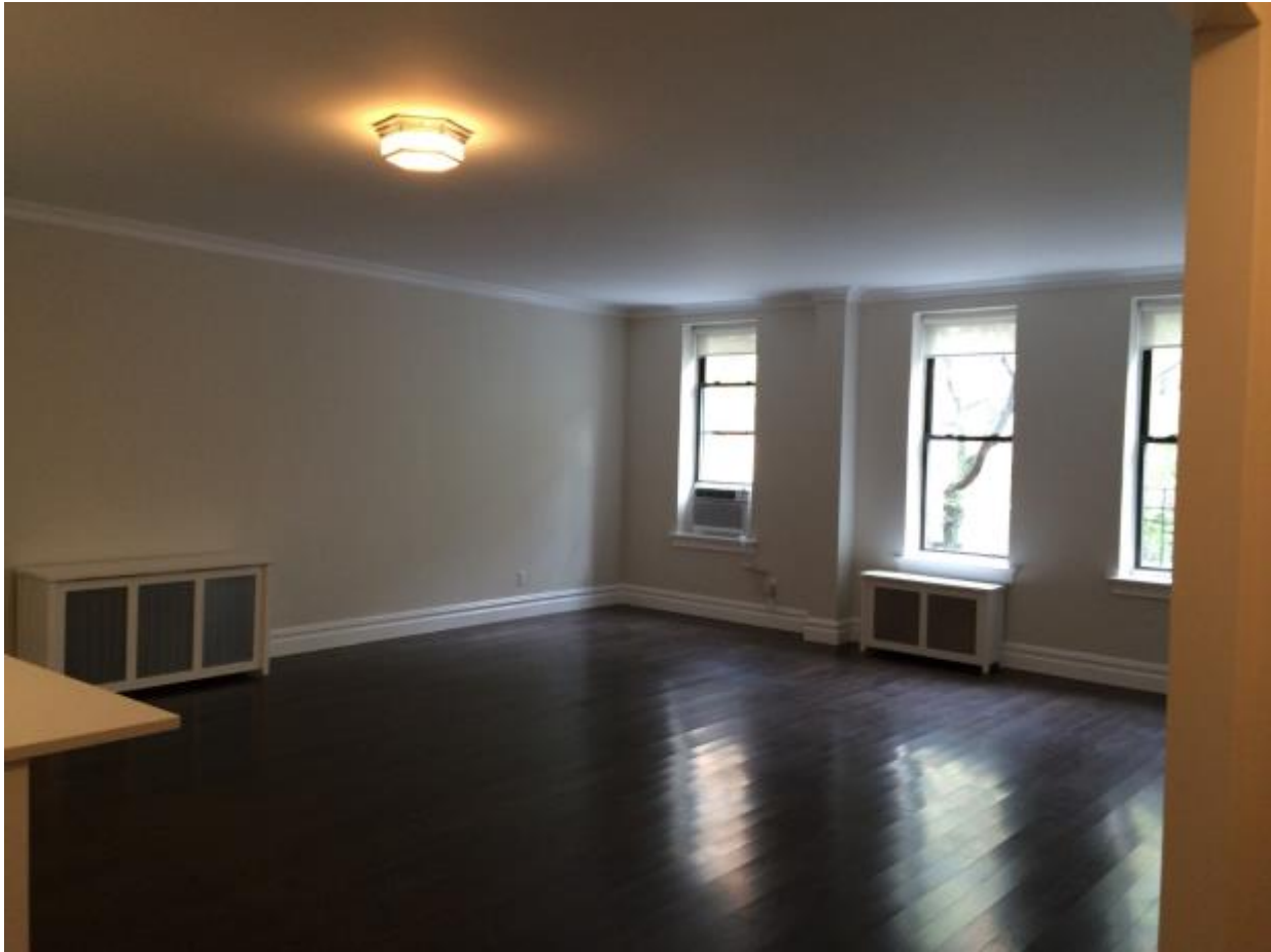
5 Finished Living room ready for tenants