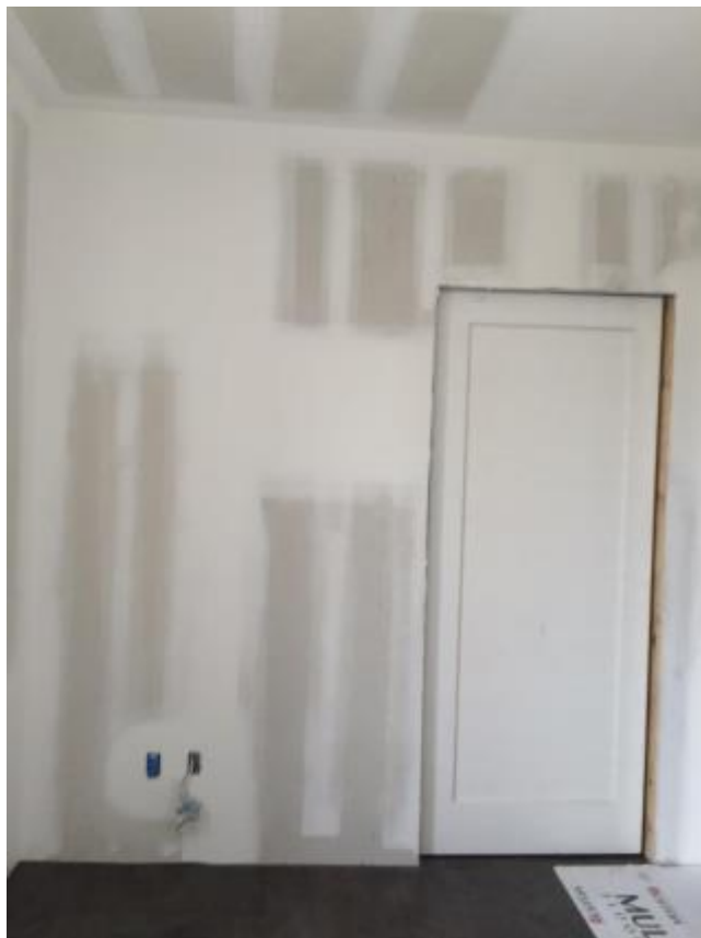
11: Finisbed Pocket door