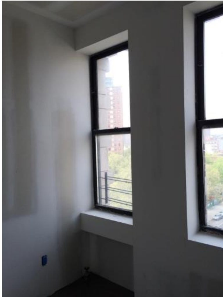
15: Existing Windows remained, new wall needed to be accurate so they meet