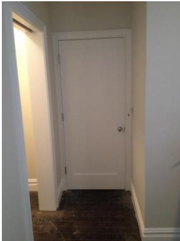
17: Installed door with hardware