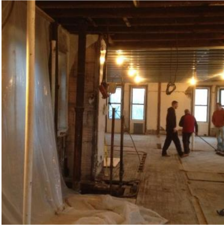
1: Existing Apartment before Renovations: Note floor