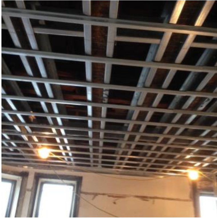
4: New Ceiling frame installed after subfloor completed