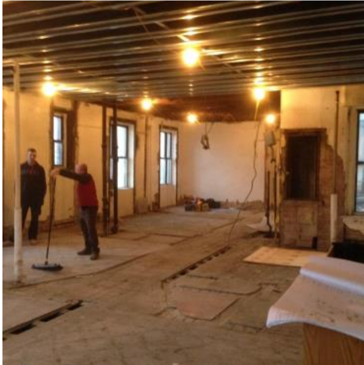
2: Apartment before Renovation. Note Walls