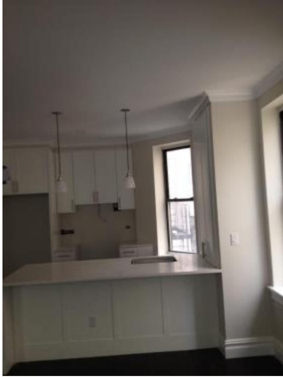
18: Finished Kitchen (Millwork and counter top by others)