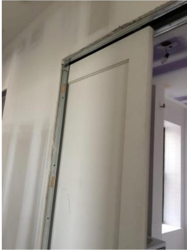
12: Installed Pocket Door