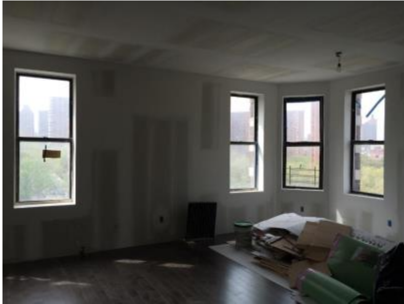
14: All outer walls were framed and sheet rocked