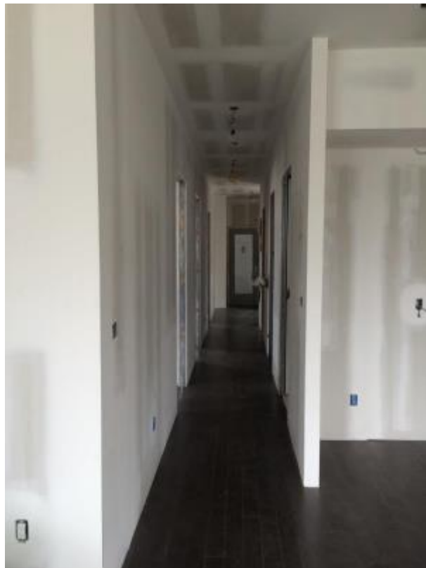
13: Finished Floor (By Others), Subfloor completely removed, and reinstalled to be level