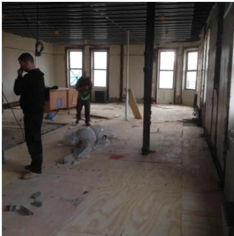
3: New Subfloor Installed. (Existing removed)