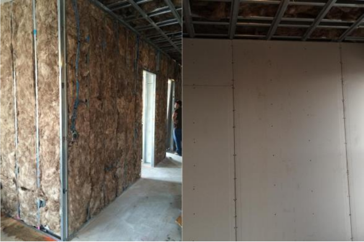
6: Insulation Installed in walls (And Ceiling) before Sheetrocking