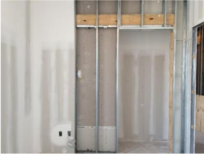
10: Pocket Doors before Sheet Rocking: