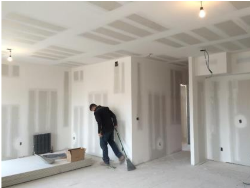
7: Finish Taping of walls and ceiling (Ready for Painting)