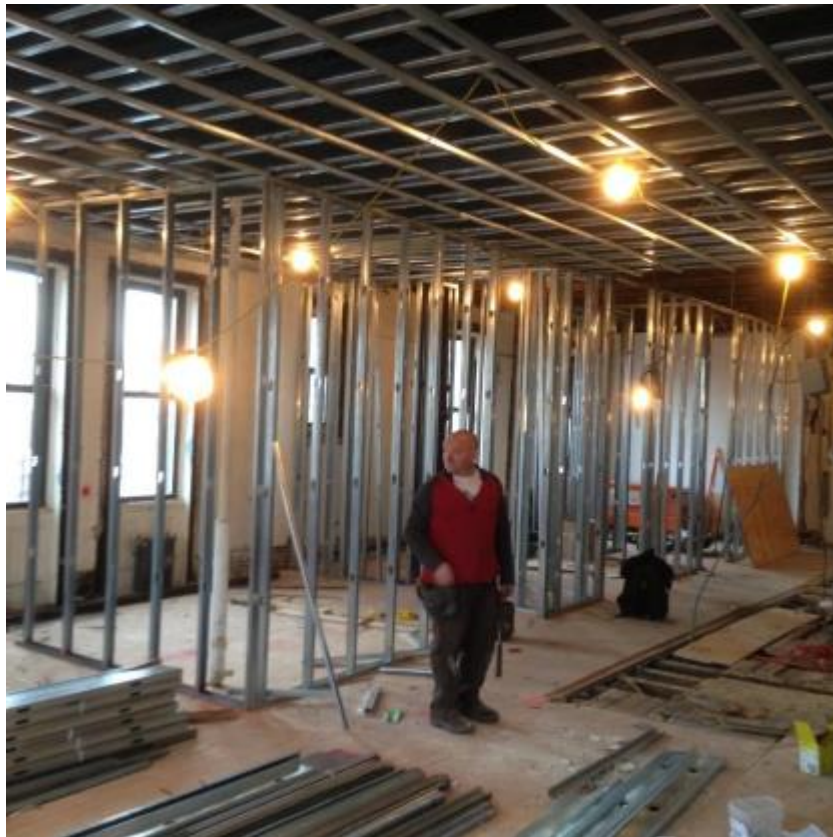
5: Midway point. New walls, floors and ceiling