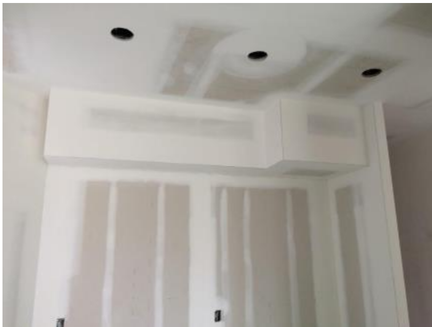
9: Close-up of Soffits