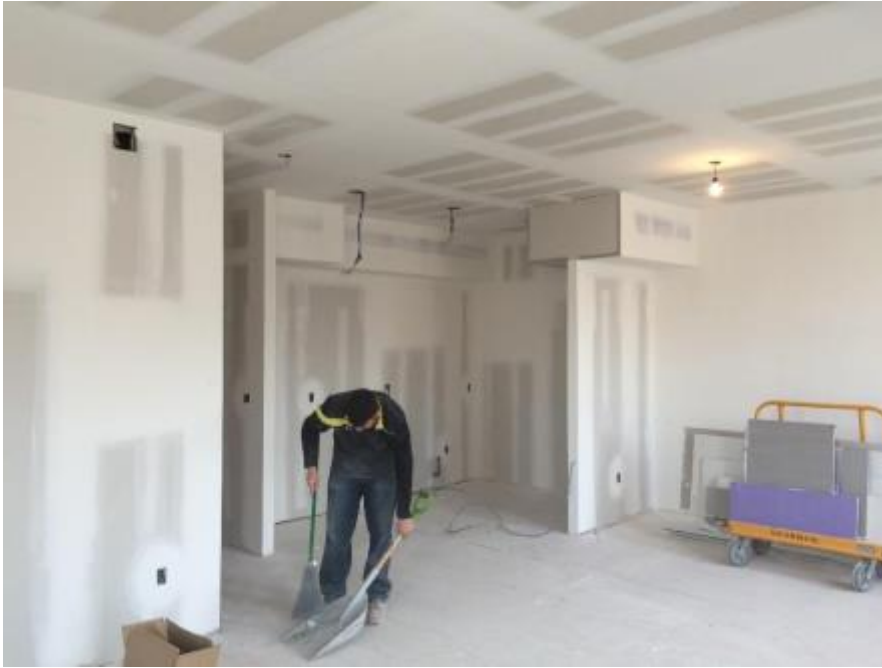
8: Kitchen Area, Note Soffits